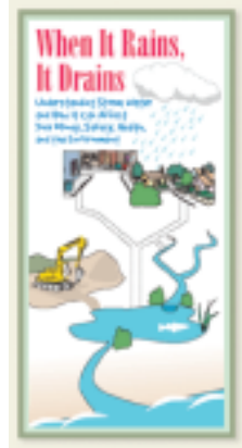
The Pennsylvania Department of Environmental Protection brochure on storm water.

Recent Federal regulations will require most municipalities in the area to adopt new methods to help improve the quality of stormwater runoff to the creeks and streams. An important aspect of these requirements is raising public awareness of the importance of this issue, and advising the Township residents how they can help in reducing stormwater pollution.